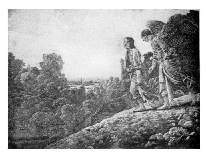
Tobias and the Angel. By Hercules Seghers