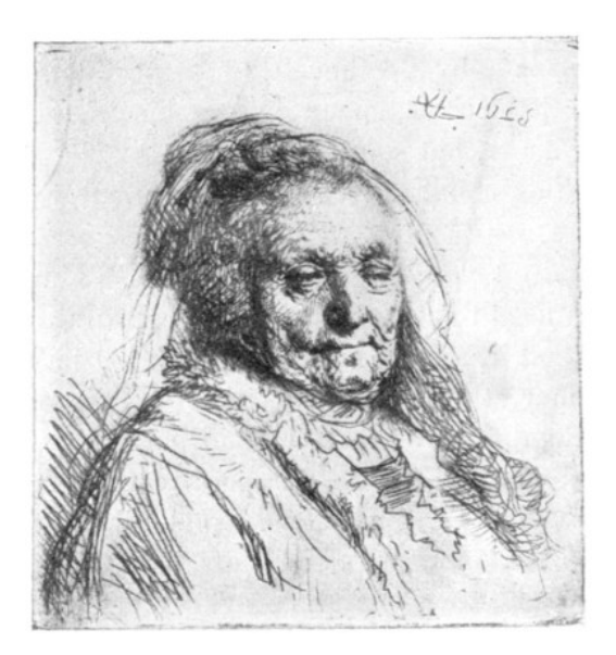
No. 1. Rembrandt's Mother.