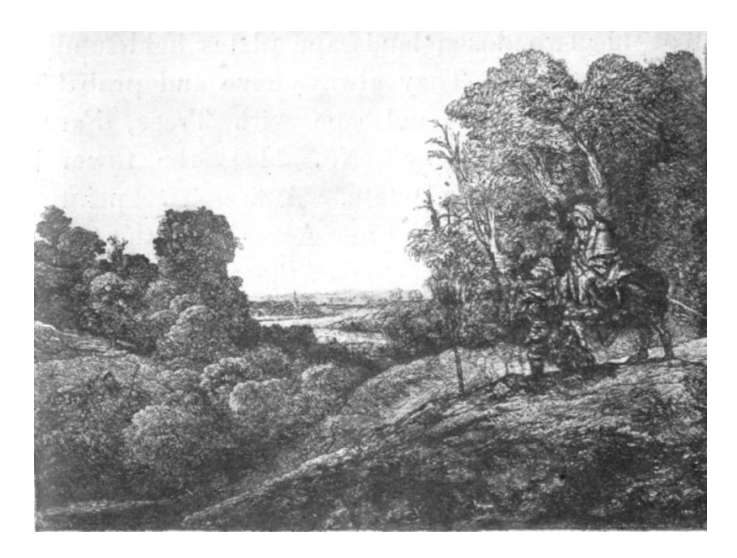
(No. 266). The Flight into Egypt.