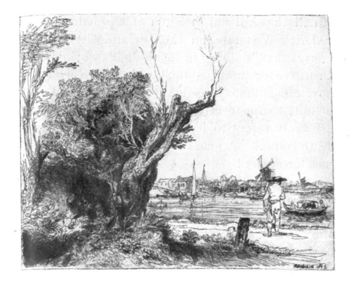
No. 210. Omval.