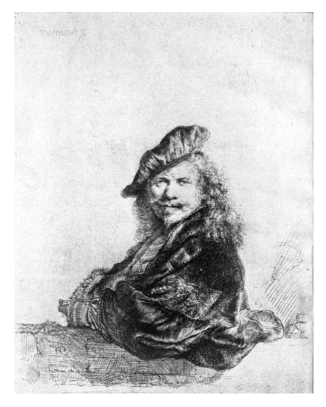
No. 168. Rembrandt Leaning on a Stone Sill