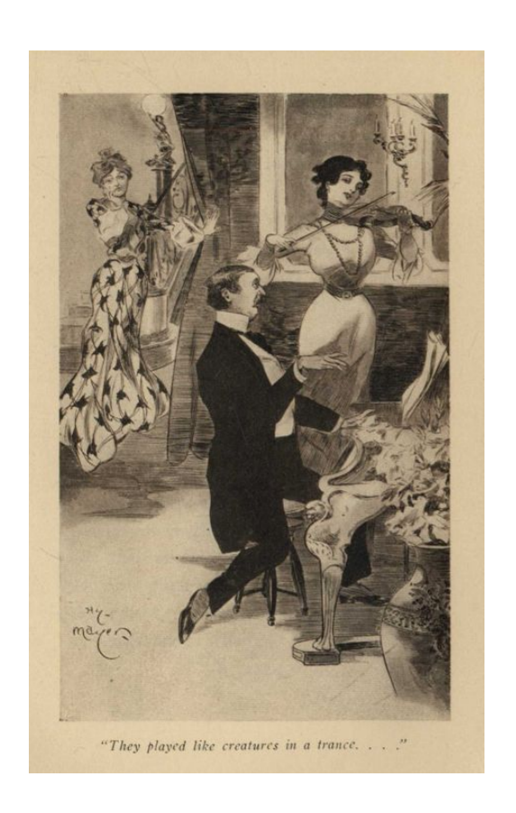
"They played \ like \ creatures \ in \ a \ trance..."