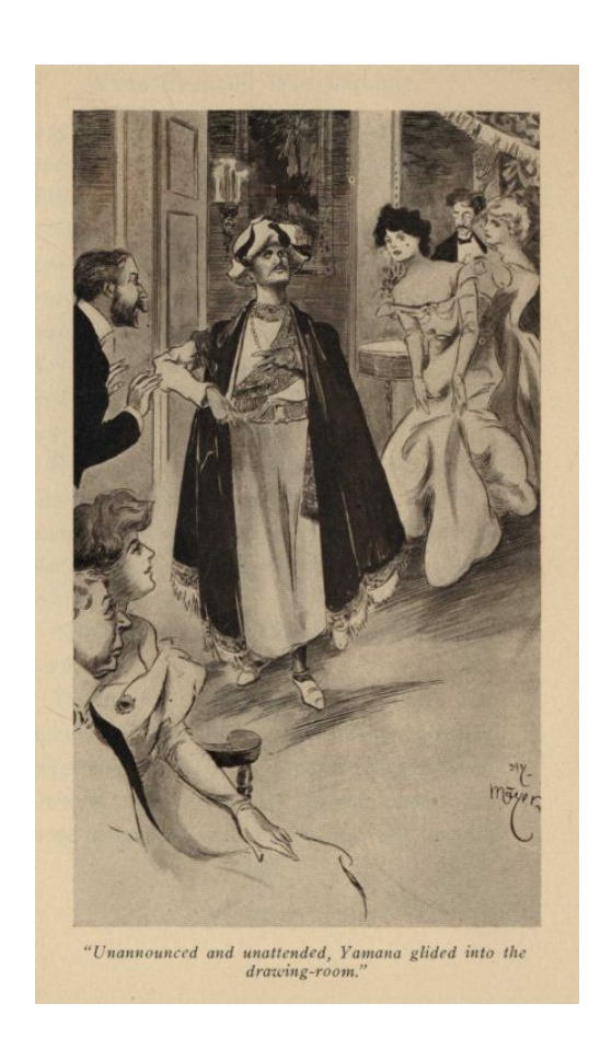
"Unannounced and unattended, Yamama glided into the drawing-room."