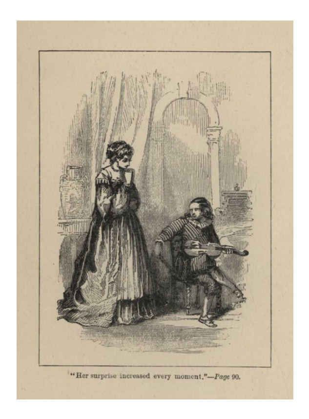
"Her surprise increased every moment."-Page 90.