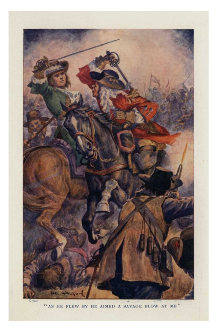
"AS HE FLEW BY HE AIMED A SAVAGE BLOW AT ME" (Page 217)