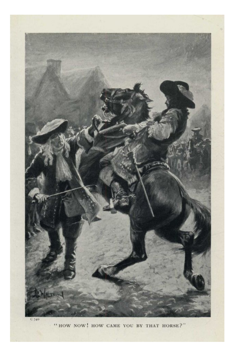
"HOW NOW! HOW CAME YOU BY THAT HORSE?"