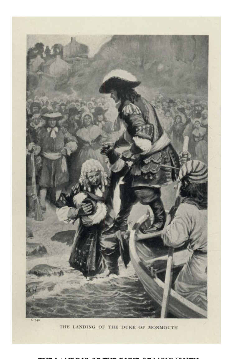
THE LANDING OF THE DUKE OF MONMOUTH