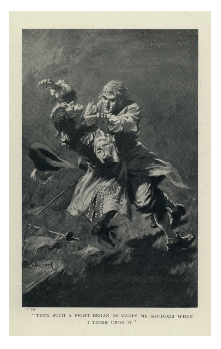
"THEN SUCH A FIGHT BEGAN AS MAKES ME SHUDDER WHEN I THINK UPON IT"