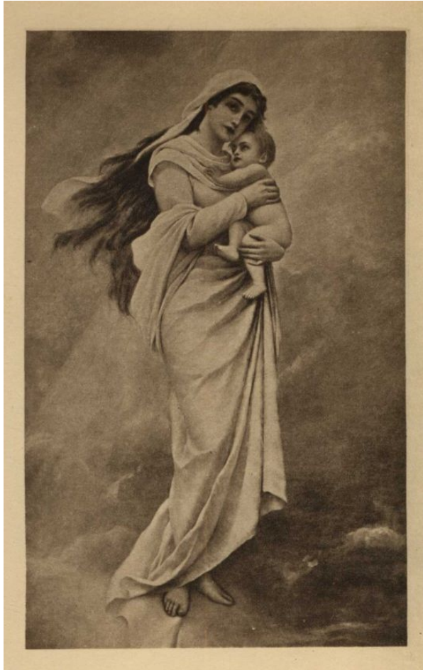
(woman and baby)