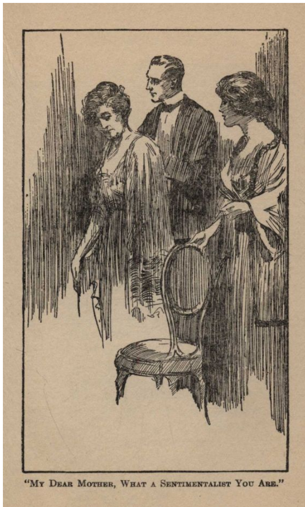
"MY DEAR MOTHER, WHAT A SENTIMENTALIST YOU ARE."

"My Dear Mother, What a Sentimentalist You Are."