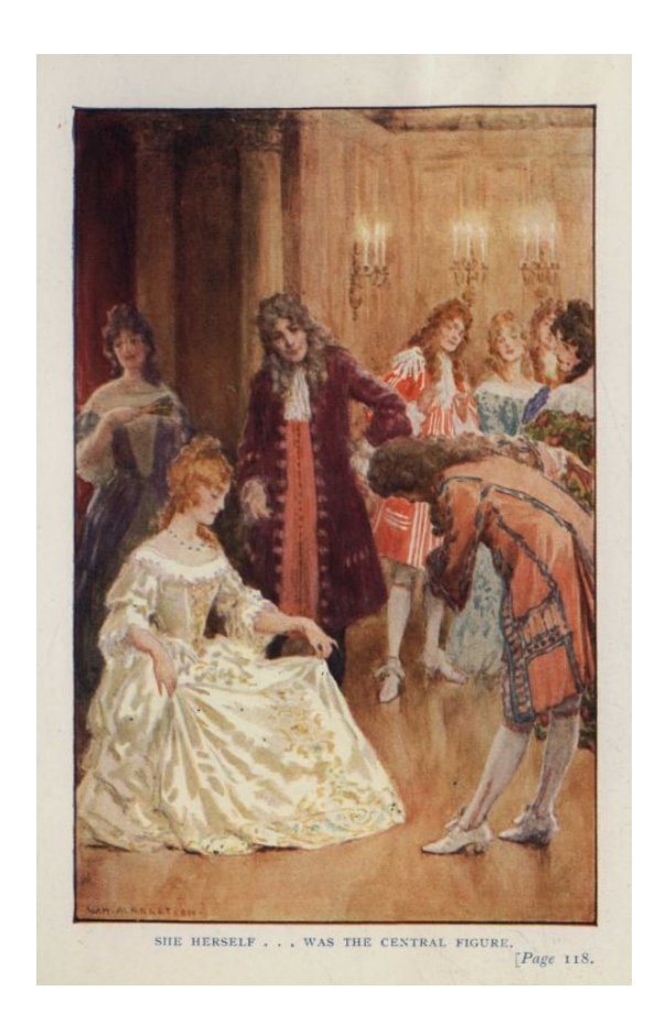
SHE HERSELF ... WAS THE CENTRAL FIGURE. Page 118.