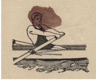
Title page picture

AUTHOR OF "Rex Kingdon of Ridgewood High," "Rex Kingdon in the the North Woods," "Rex Kingdon at Walcott Hall," "Rex Kingdon Behind the Bat," etc.