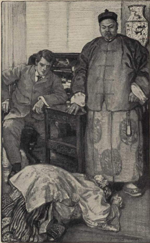
The girl threw herself on the floor Page 55