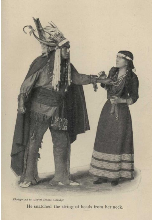
He snatched the string of beads from her neck.