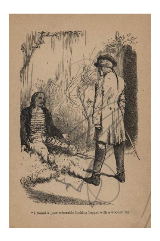
"I found a poor miserable-looking beggar with a wooden leg."

"I have little to tell you about the next six or seven years, during which time my bad fortune still followed me, and the state of my affairs grew gradually worse and worse. One thing, however, I must relate. I had been out one afternoon for a walk, and on returning, just at dusk, I found a poor miserable looking beggar, with a wooden leg, sitting on the grass near our cottage door, eating some food which my wife had just given him. I said a few words to him when I came up, and as some of his answers interested me, I asked him to stop a little while and give me an account of himself.