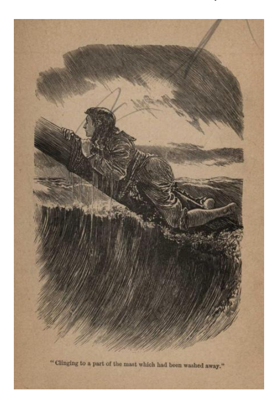
"Clinging to a part of the mast which had been washed away."

the sailors were trying in vain to furl the sails, the rest were kept busily at work at the pumps. By this time the hold was half full of water, and every moment we were expecting the ship to go to pieces, as her timbers were too old and rotten to bear the strain upon them. Soon we lost all hope of saving the ship, and the crew ceased making any further exertions, every one seeking for some means of saving his own life. The vessel then began to settle deeper and deeper in the water, and soon after disappeared beneath the waves. Before this, however, I had thrown myself into the sea, and was then clinging to a part of the mast, which had been washed away. Several of the crew beside myself had sought for safety in a similar way; but when the sky grew a little lighter, and I was able to look around me, I could see no one, I seemed to be the only survivor.