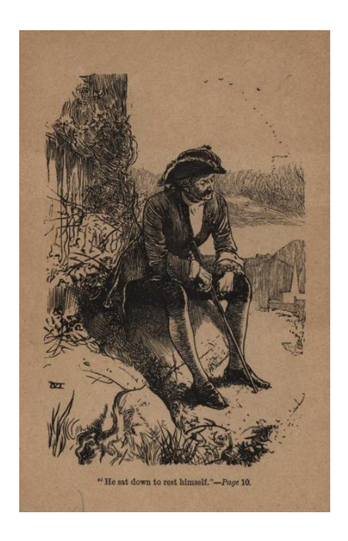
"He sat down to rest himself."—Page 10.