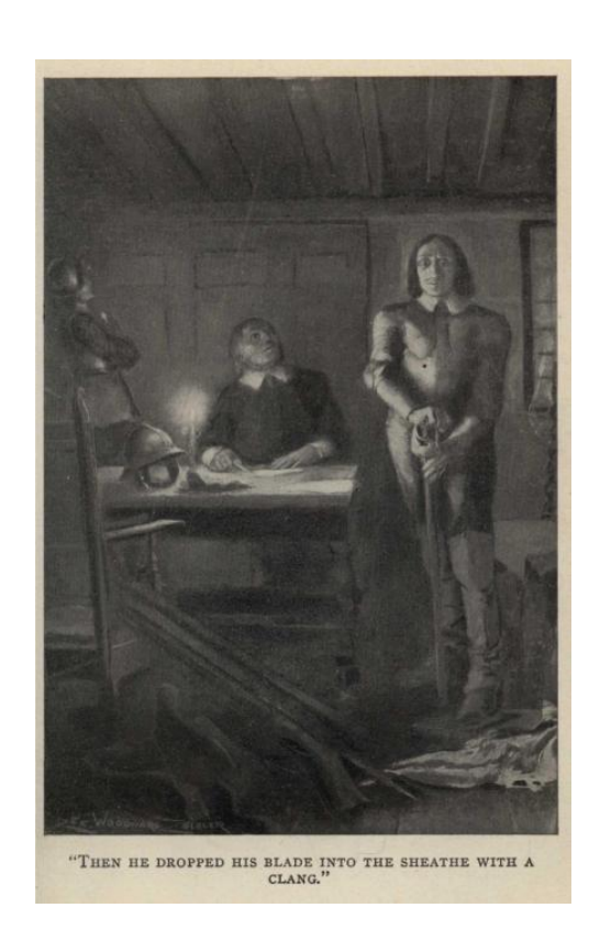
"THEN HE DROPPED HIS BLADE INTO THE SHEATHE WITH A CLANG."