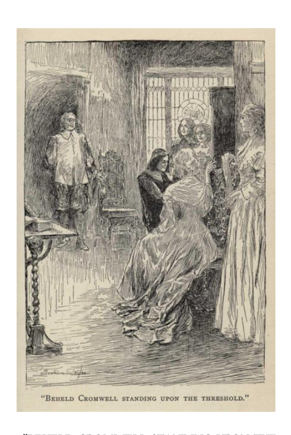
"BEHELD CROMWELL STANDING UPON THE THRESHOLD."