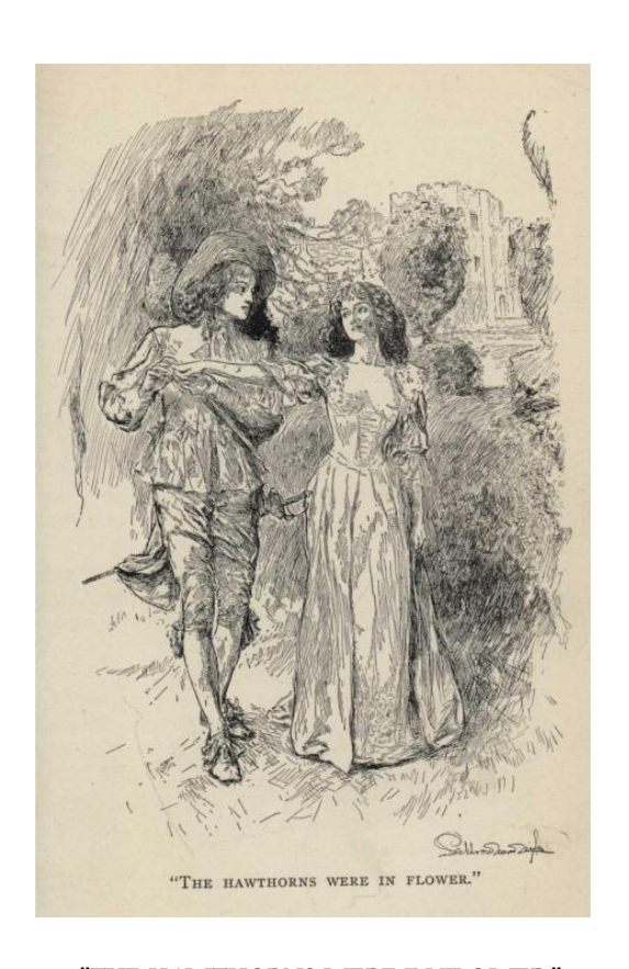
"THE HAWTHORNS WERE IN FLOWER."