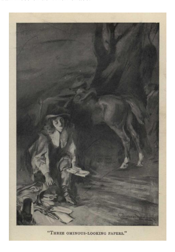
"THREE OMINOUS-LOOKING PAPERS."

bag, and turned the light upon its contents. The small private letters she hardly noticed, but there were three ominous-looking papers closed with large red seals, and these she instantly seized. They were all directed to the Sheriff of Ely; and she felt sure they were the authority for Stephen's arrest. She took possession of the whole three, bade Yupon set loose the horse, and leaving the other contents of the rifled mail-bag on the grass by the side of the bound carrier, she put into her companion's hand the promised gold pieces, and then slipped away into the shadows and darkness of de Wick chase.