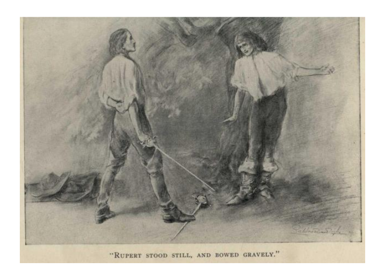
"RUPERT STOOD STILL, AND BOWED GRAVELY."

will had taken its place. Neville hastened forward, as he had been advised, and Rupert returned to Paris. He knew Matilda was expecting him, and he pictured to himself her disappointment and anxiety at his non-appearance; it was also her last evening in Paris, and it grieved him to miss precious hours of love, that might never be given him again. Yet he was physically exhausted, and as soon as he threw himself upon a couch he forgot all his weariness and all his anxieties in a deep sleep.