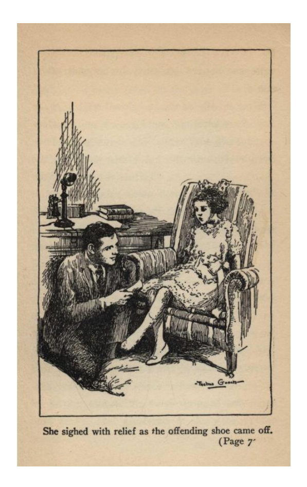
She sighed with relief as the offending shoe came off.