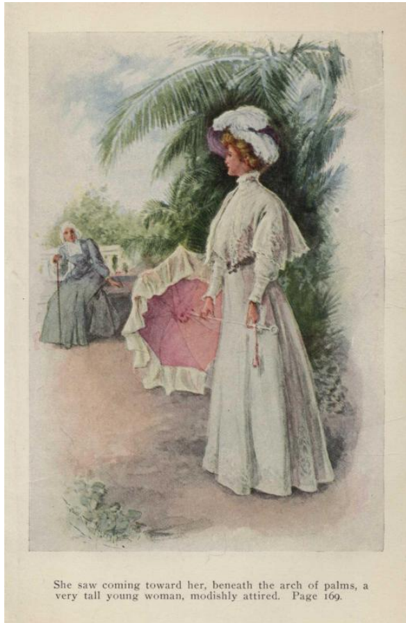
She saw coming toward her, beneath the arch of palms, a very tall young woman, modishly attired. Page 169.

She saw coming toward her, beneath the arch of palms, a very tall young woman, modishly attired.