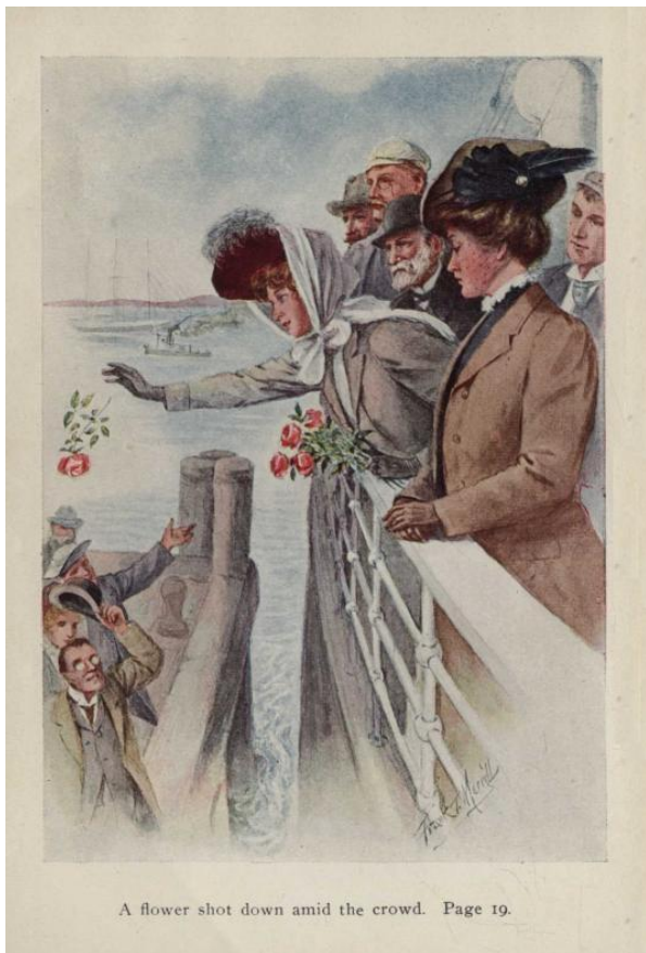
A flower shot down amid the crowd. Page 19.