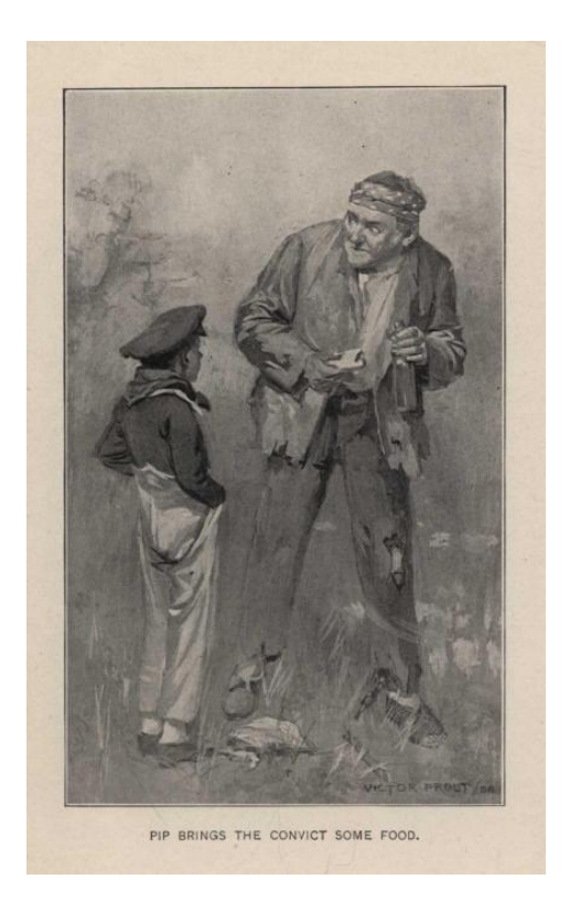
PIP BRINGS THE CONVICT SOME FOOD.

upon the hob. Suddenly he turned to the sergeant and remarked: