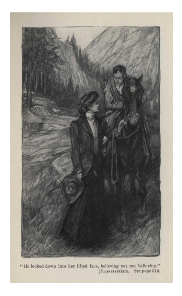
"He looked down into her lifted face, believing yet not believing." Frontispiece. See page 312.