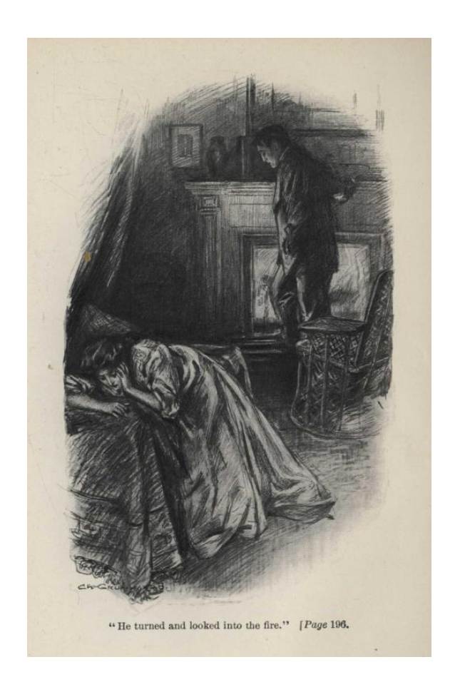
{''} He turned and looked into the fire."