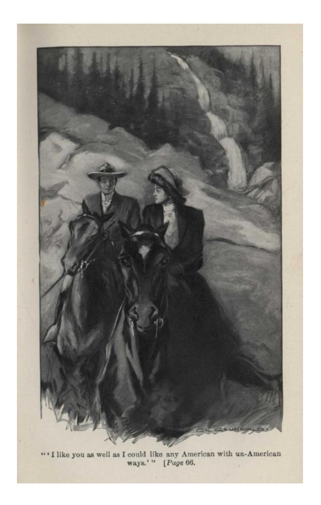
"I like you as well as I could like any American with un-American ways."