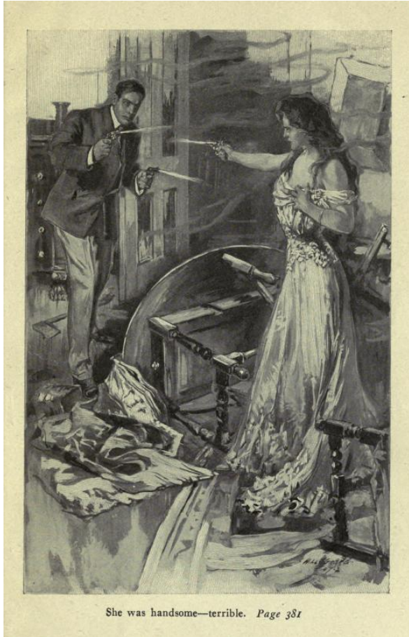
She was handsome—terrible. Page 381