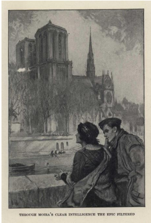
THROUGH MOIRA'S CLEAR INTELLIGENCE THE EPIC FILTERED