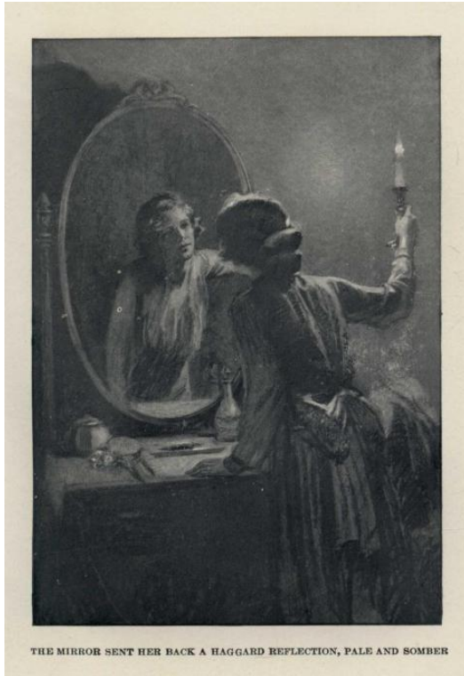
THE MIRROR SENT HER BACK A HAGGARD REFLECTION, PALE AND SOMBER