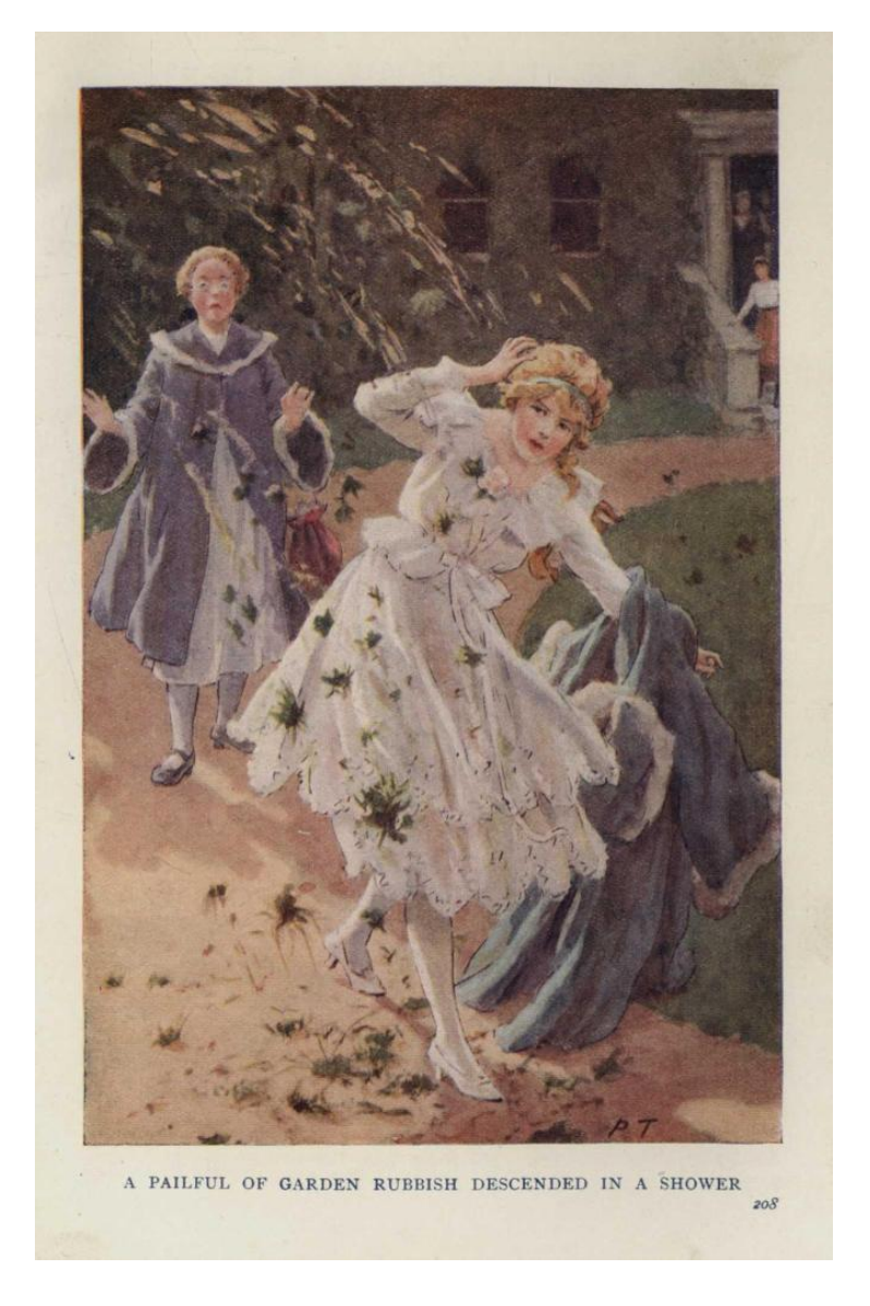
A PAILFUL OF GARDEN RUBBISH DESCENDED IN A SHOWER