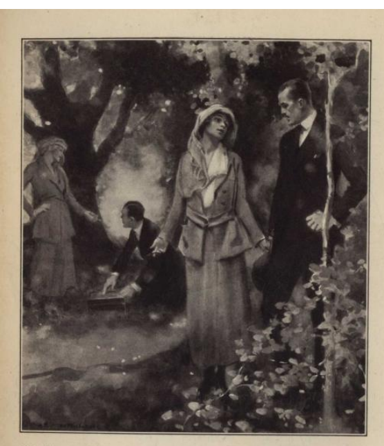
"Oh, as for cheering people up—I don't know . . . A woman wants more than anything else in the world to feel that she's needed; and when she discovers she isn't—"

"Oh, as for cheering people up—I don't know ... A woman wants more than anything else in the world to feel that she's needed; and when she discovers she isn't—"