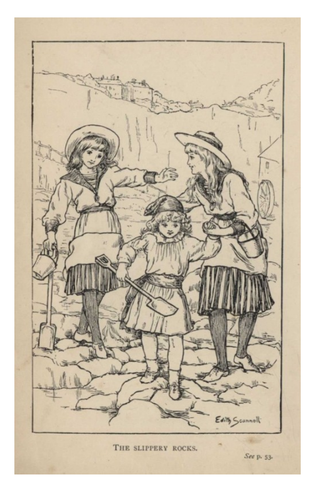
THE SLIPPERY ROCKS. See p. 53.