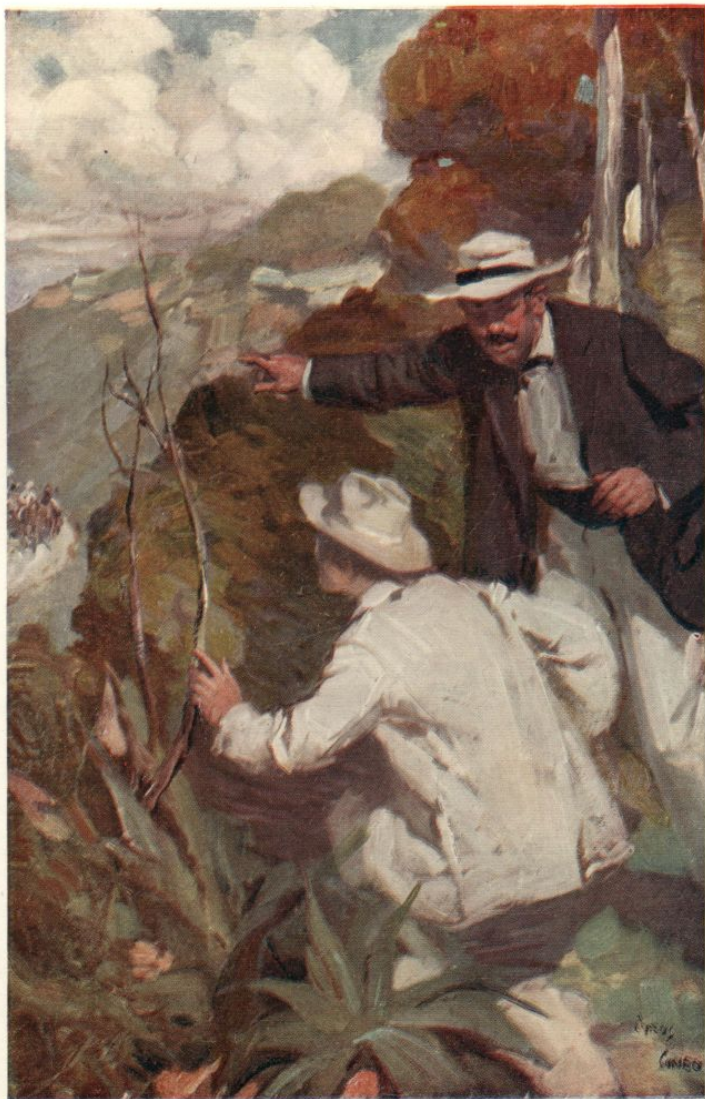
HORSEMEN ON THE TRACK