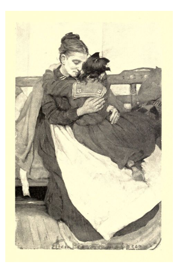
"Hazel flung both arms around Mrs. Blossom's neck"

you were mine! I love you so-" Hazel flung both arms around Mrs. Blossom's neck and sobbed out,-"I 've wanted to call you Mother Blossom and hug and kiss you like the rest-but Cherry was so jealous-the first time I did it-that she-she stuck burrs in my bed and led me through the nettle-patch when we were raspberrying, because she knew I did n't know nettles; and Chi told me we 'd got to be brave if we joined the N.B.B.O.O., and I knew I ought to bear it-for I do love to be here-and I love them all, for most of the time they 're lovely to me;-and I don't think you 've been horrid, Rose, only you did hurt my feelings when you would n't let me give you the blue silk-and-and it is n't my fault if I am rich, and it is n't fair not to like me for it!"