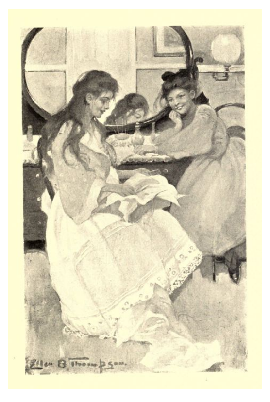
"The two girls leaned over the box as Hazel took off the wrapper"

"May I open them, Rose, and won't you wear some if they 're from Jack?" "Yes," said Rose, simply. The two girls leaned over the box as Hazel took off the wrapper-then the cover-then the inner tissue papers-then-