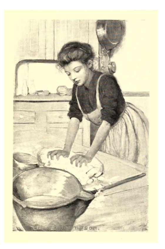
"Rose was at the kitchen table, patting out the dough for the rolls"

"'I told thee when love was hopeless; (thump) But now he is wild and sings–(thump) That the stars above (thump! thump!!) Shine ever on Love–(thump–)'"