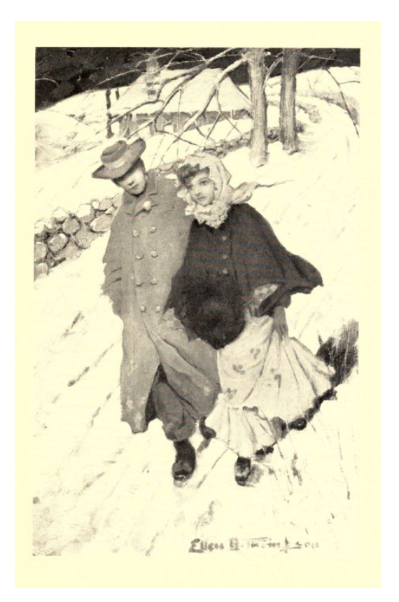
"I want to tell you why I came up here'"

"Miss Blossom,"-somehow Jack had not quite the courage to say "Rose," although he had been so frankly invited to-"I want to tell you why I came up here; it must have seemed almost an intrusion."