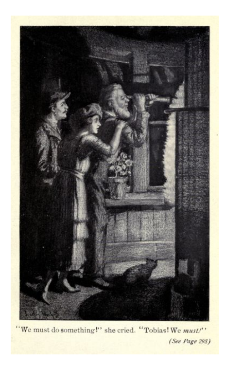
"We must do something!" she cried. "Tobias! We must!"

"Tobias, they've got one at Upper Trillion!" the girl exclaimed suddenly.