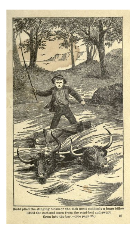
Budd plied the stinging blows of the lash until suddenly a huge billow lifted the cart and oxen from the road-bed and swept them into the bay.

the waves dashed over their backs and rushed into the cart, wetting Budd to the knees. Then there came suddenly a huge billow, rolling outward, that lifted the cart and oxen from the road-bed and swept them out into the bay.