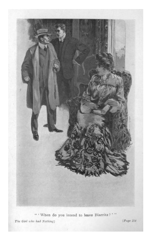
"When do you intend to leave Biarritz?"

George opened his lips furiously, but snapped them shut again. Then, having paused to reflect, he said: "I am here only for an hour. I'm going on to Spain."