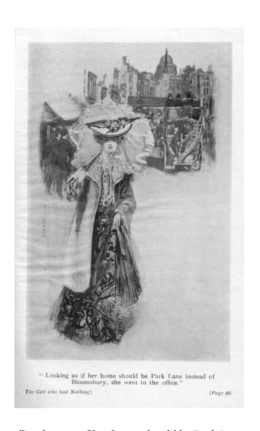
"Looking as if her home should be Park Lane instead of Bloomsbury, she went to the office."