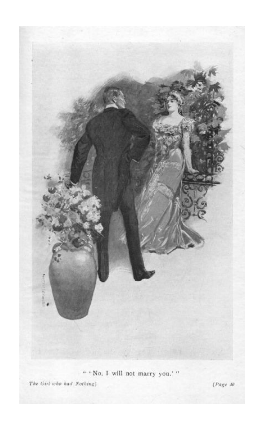
"No, I will not marry you."