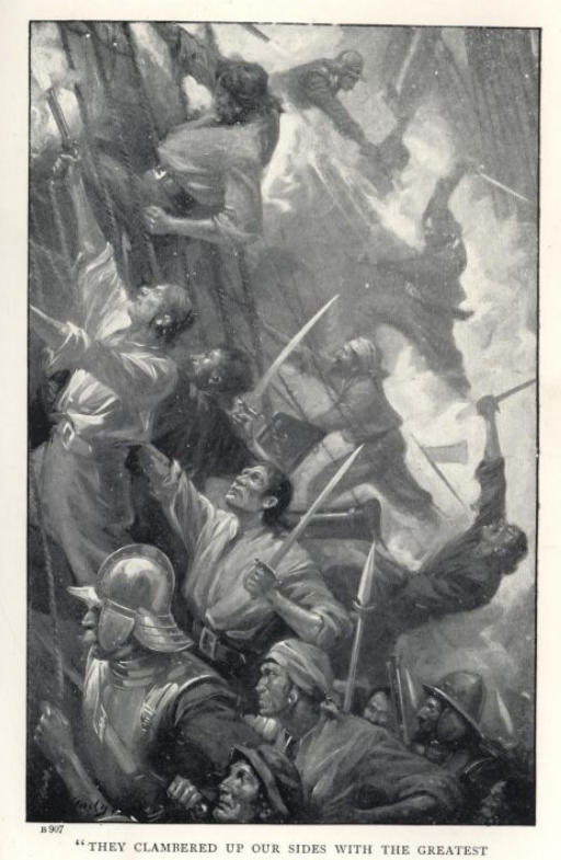
"THEY CLAMBERED UP OUR SIDES WITH THE GREATEST INTREPIDITY"