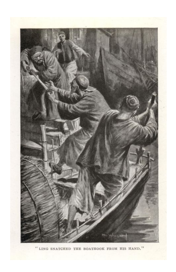
"LING SNATCHED THE BOATHOOK FROM HIS HAND."