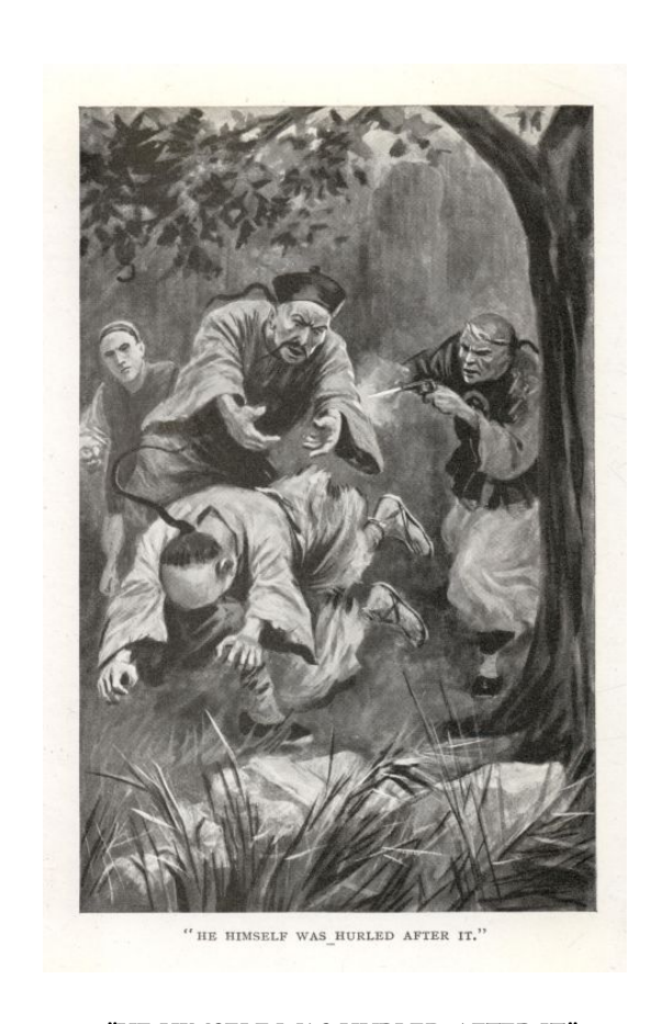
"HE HIMSELF WAS HURLED AFTER IT."