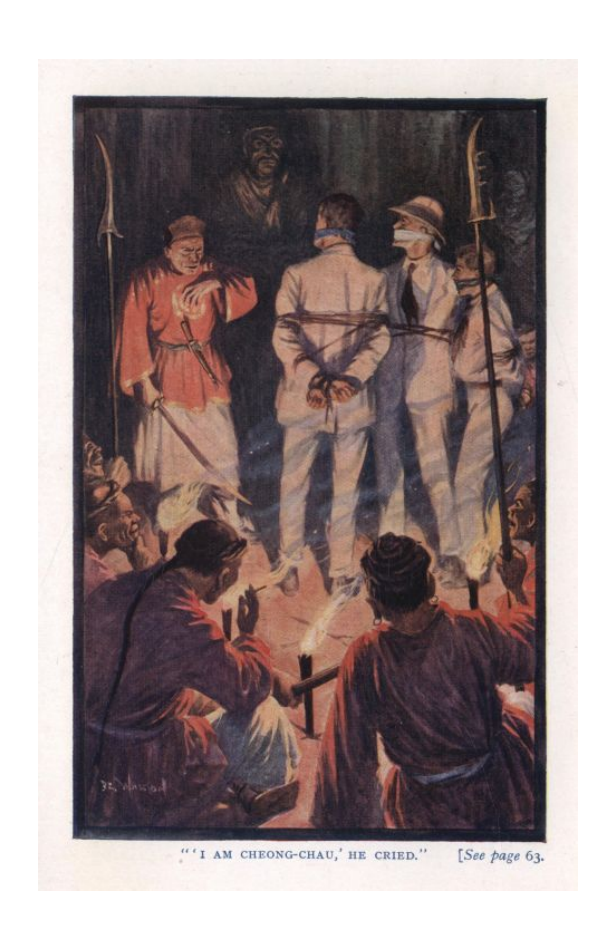
"I AM CHEONG-CHAU," HE CRIED." See page 63.