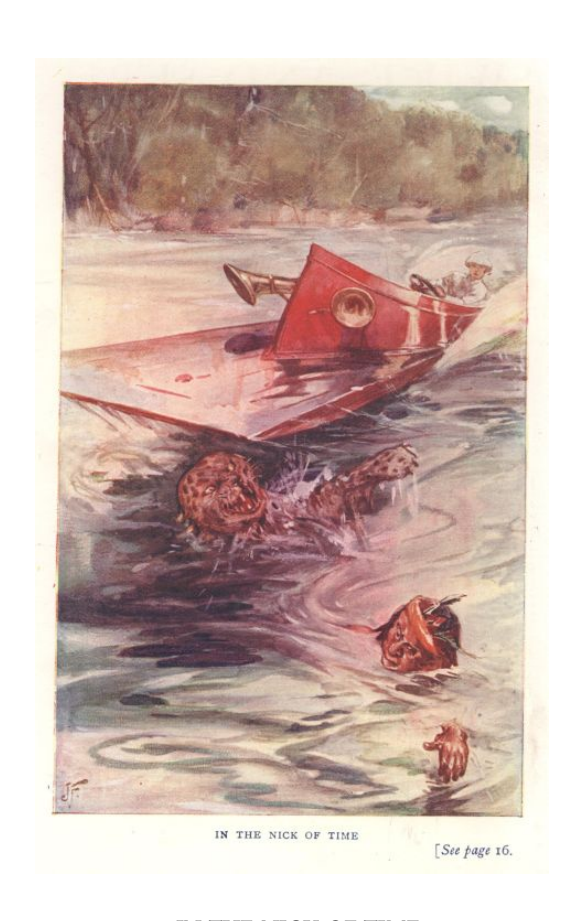
IN THE NICK OF TIME