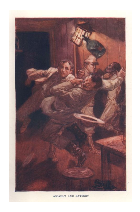
ASSAULT AND BATTERY