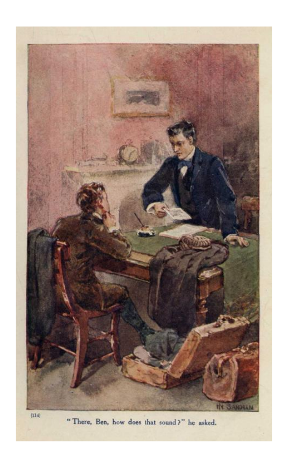
"There, Ben, how does that sound?" he asked.