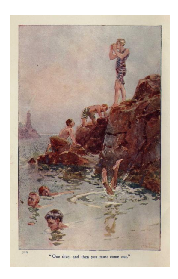
"One dive, and then you must come out."