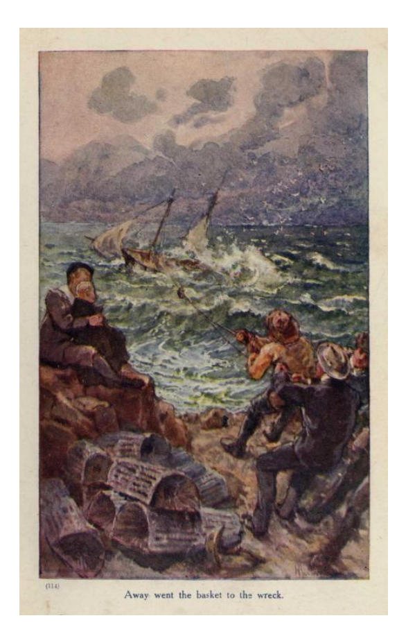
Away went the basket to the wreck.