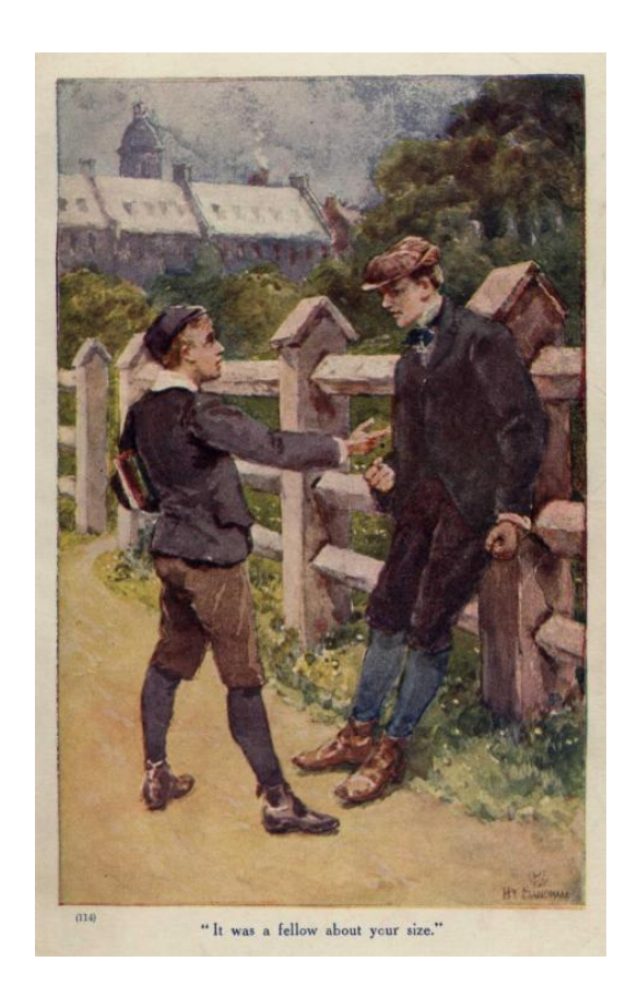
"It was a fellow about your size."