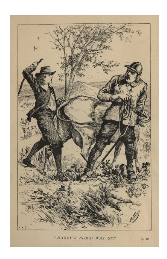
"HARRY'S BLOOD WAS UP"