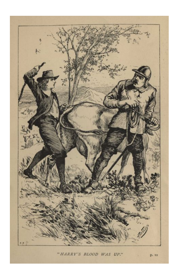
"HARRY'S BLOOD WAS UP." p. 12