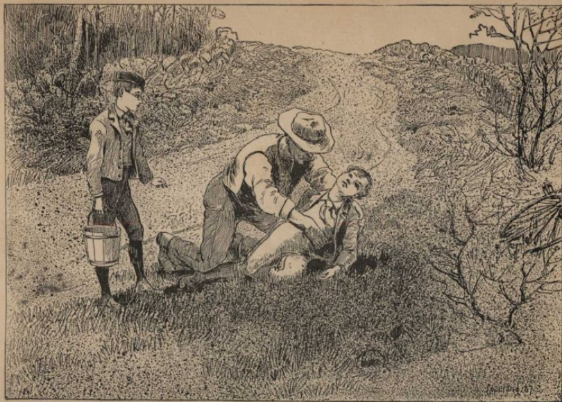
"To his delight, he found that Felix was sitting up." — Page 120.

"There's a pail in the bottom of my cart," said the man: "go and get it, and then run to the brook down yonder, and bring some water."