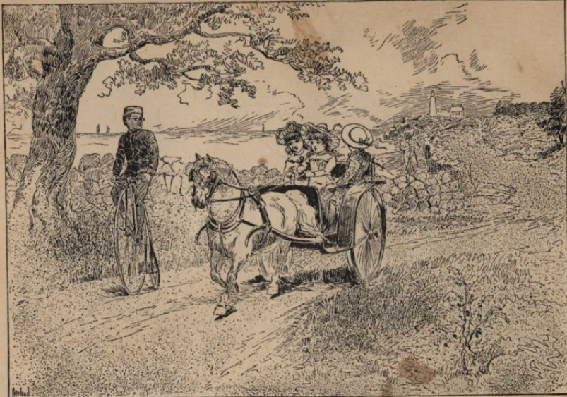
"Ruth looked back and smiled at him." — Page 283.

"Now, you have as good a time as ever you can, Ruth: you don't git sich a chance every day, you know."