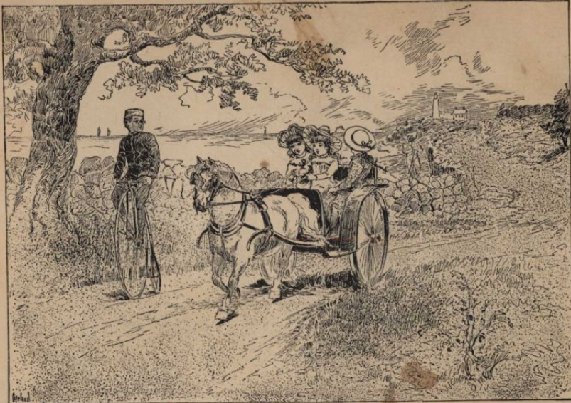
"Ruth looked back and smiled at him." — Page 283.

"Now, you have as good a time as ever you can, Ruth: you don't git sich a chance every day, you know."