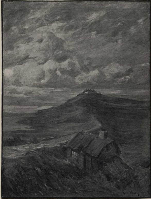
ALONG THE DIKE