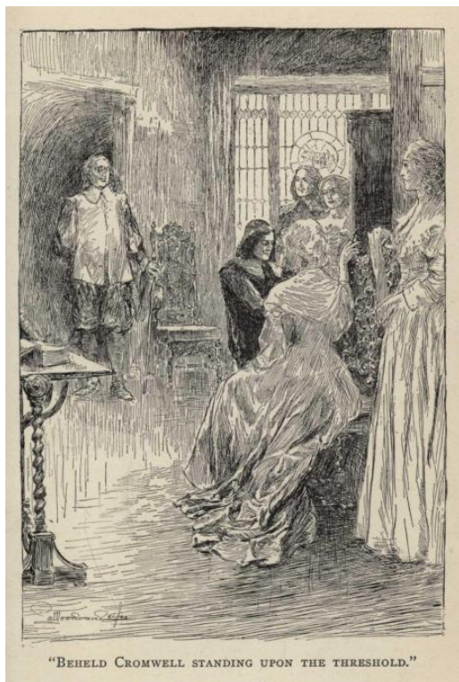
"BEHELD CROMWELL STANDING UPON THE THRESHOLD."