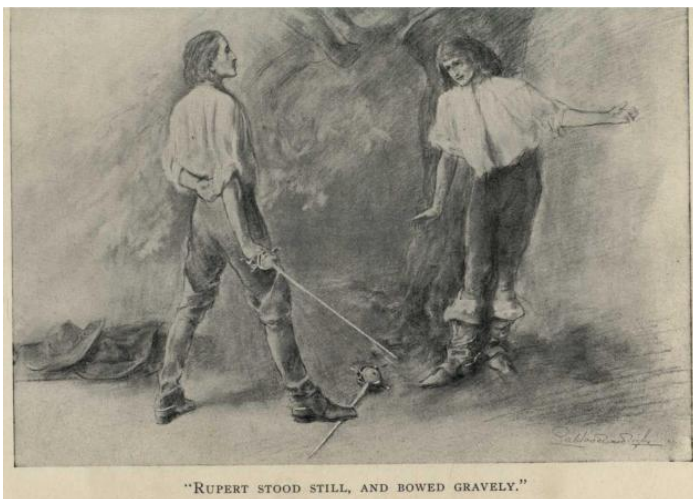
"RUPERT STOOD STILL, AND BOWED GRAVELY."

will had taken its place. Neville hastened forward, as he had been advised, and Rupert returned to Paris. He knew Matilda was expecting him, and he pictured to himself her disappointment and anxiety at his non-appearance; it was also her last evening in Paris, and it grieved him to miss precious hours of love, that might never be given him again. Yet he was physically exhausted, and as soon as he threw himself upon a couch he forgot all his weariness and all his anxieties in a deep sleep.