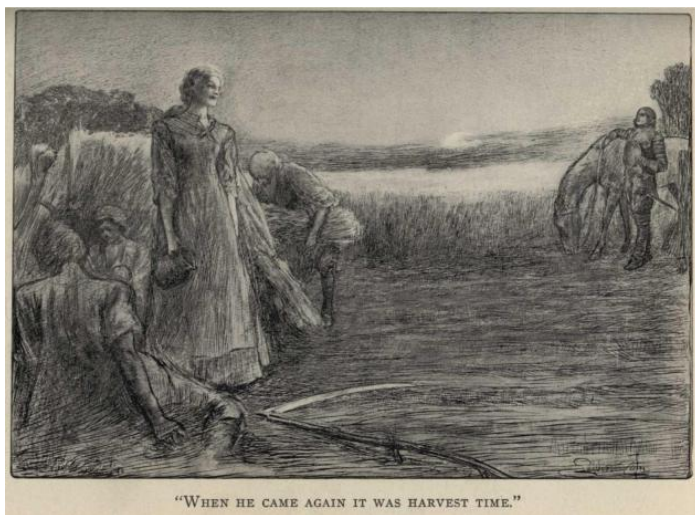
"WHEN HE CAME AGAIN IT WAS HARVEST TIME."

"Farewell, Jane! Darling Jane!"—then, afraid of his own temerity, he was away ere he could see the wonder and joy called into her face by the sweet familiar words.