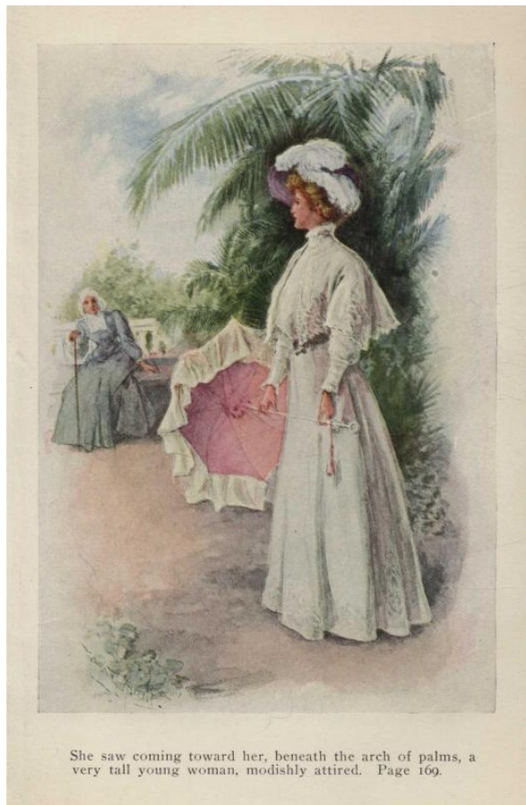
She saw coming toward her, beneath the arch of palms, a very tall young woman, modishly attired. Page 169.

She saw coming toward her, beneath the arch of palms, a very tall young woman, modishly attired.