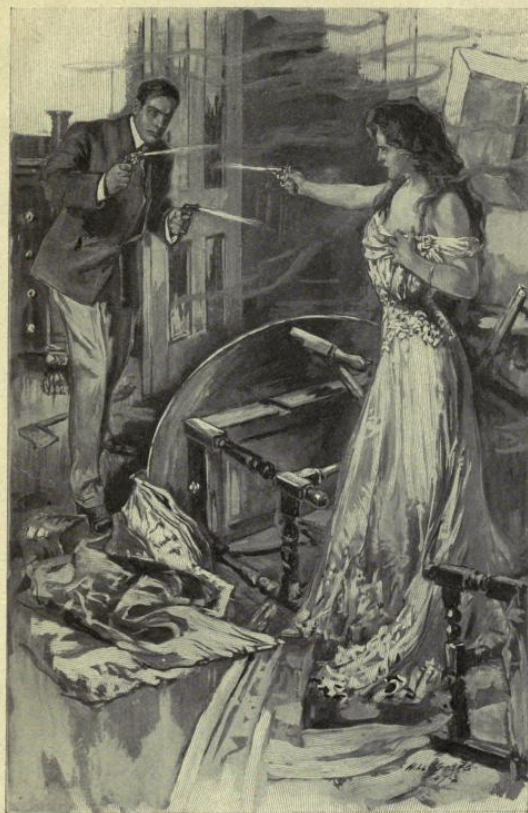
She was handsome—terrible. Page 381