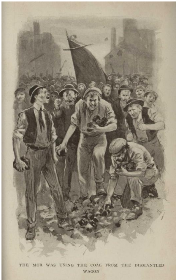
THE MOB WAS USING THE COAL FROM THE DISMANTLED WAGON