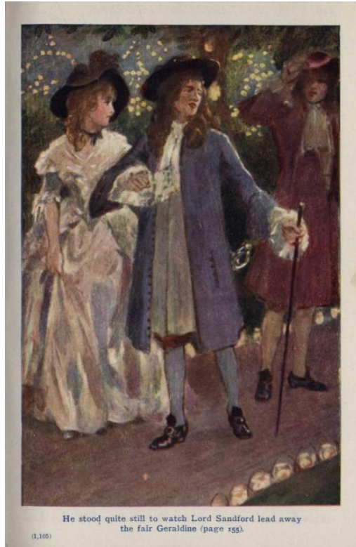
He stood quite still to watch Lord Sandford lead away the fair Geraldine (page 155).