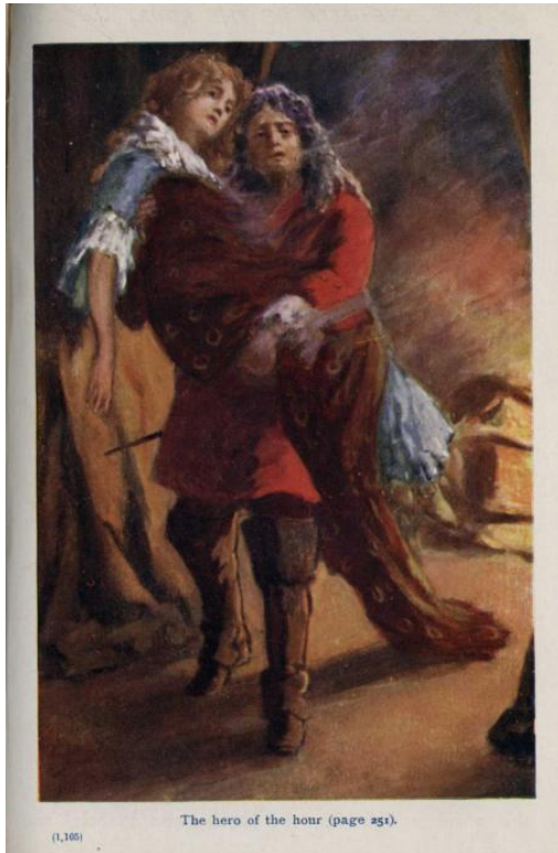
The hero of the hour (page 251).

sometimes conscious of an undercurrent of hostile jealousy directed against him, which increased with his increasing popularity with the public. He could not doubt that if some mischance were to befall him or his patron, his fall would be acclaimed in many circles with delight, as making room for another to fill his vacant place. And Grey, looking at the hollow cheeks and the gaunt frame of the Old Lion, hearing from time to time his painful coughing, began to fear that he, indeed, would not long be able to face the world or fight his own battle; and doubtful, indeed, did he feel of his own power and ability to fight that battle for himself single-handed.