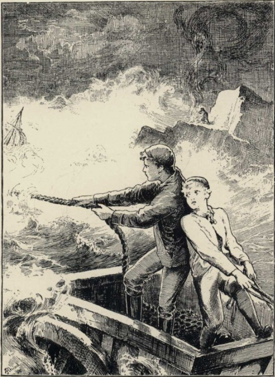
A PERILOUS RESCUE. Page 132.