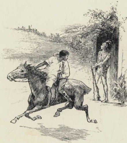
FLEEING FROM THE TANA.