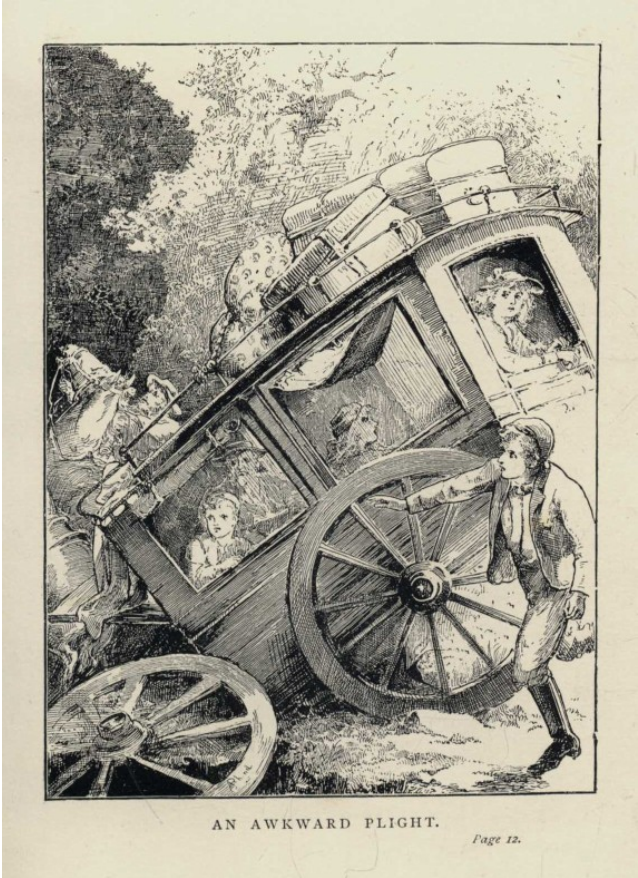
AN AWKWARD PLIGHT.