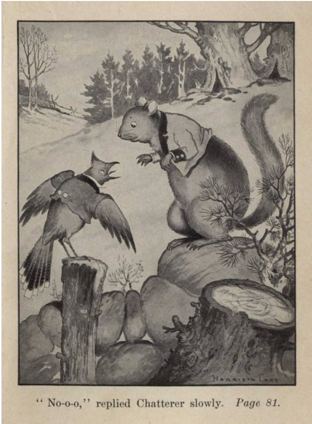
”No-o-o,” replied Chatterer slowly.