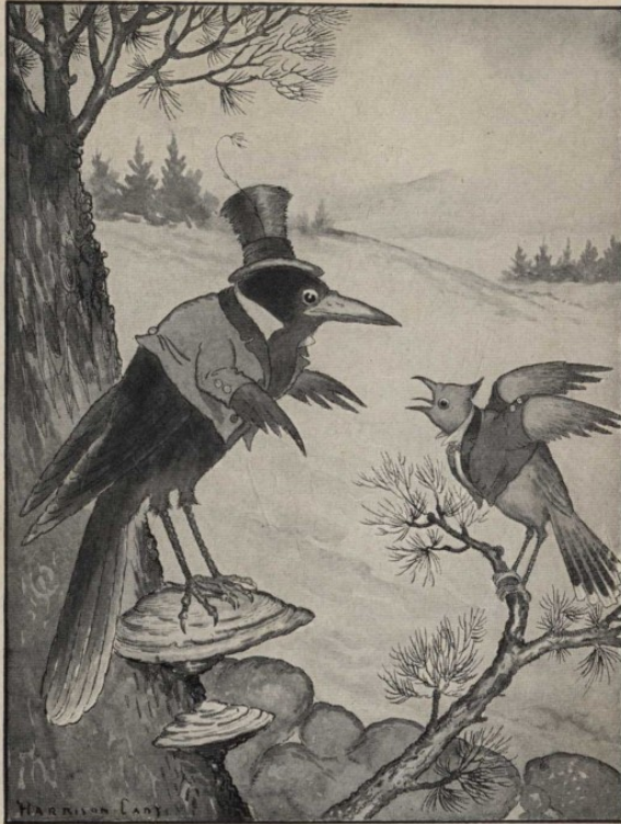
Sammy flew straight over to where Blacky was sitting. Page 102.

Sammy flew straight over to where Blacky was sitting.