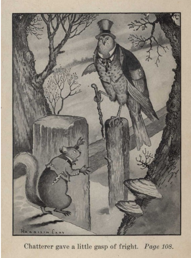
Chatterer gave a little gasp of fright.