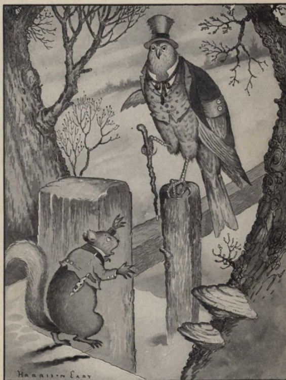
Chatterer gave a little gasp of fright. Page 108.