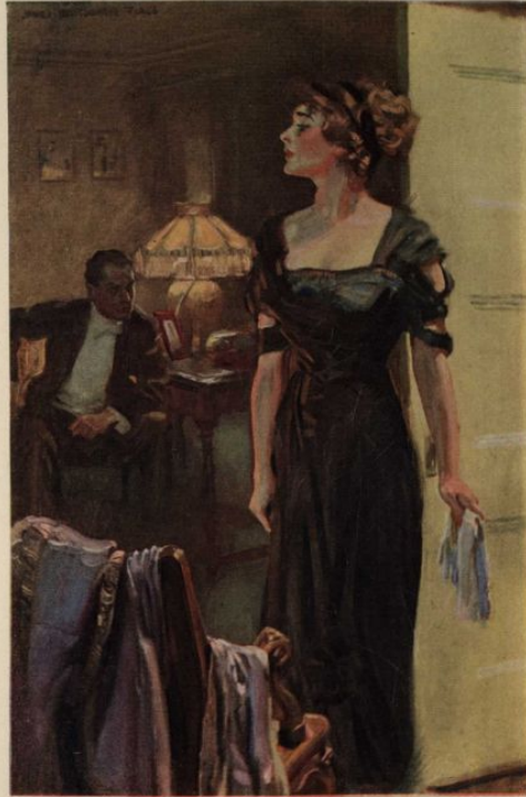
"I despise your threats," she said, choking with her own words. "I despise you."

"I despise your threats," she said choking with her own words. "I despise you."