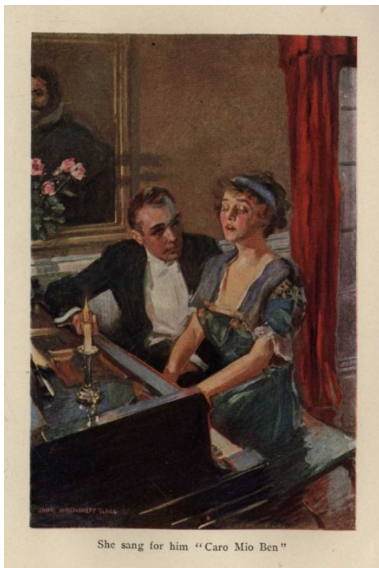
She sang for him "Caro Mio Ben"