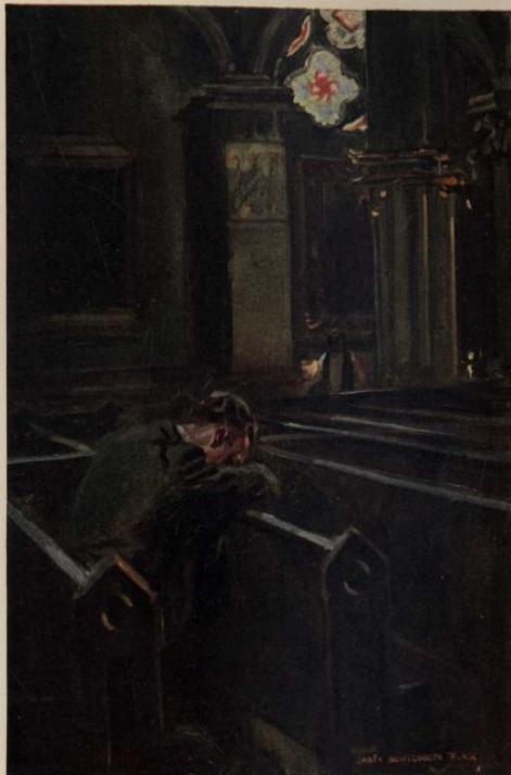
An acolyte, entering in the gray of the early morning, saw on the last of the kneeling benches a man resting with bowed head