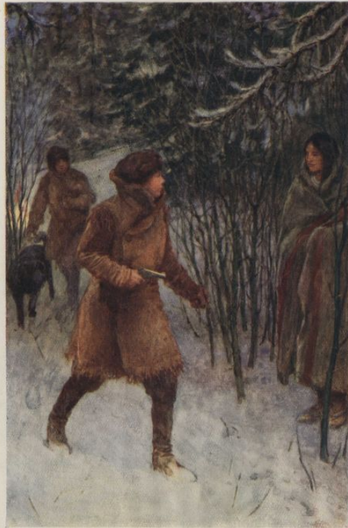
Motionless before her stood a figure wrapped in the usual Indian blanket. p. 100