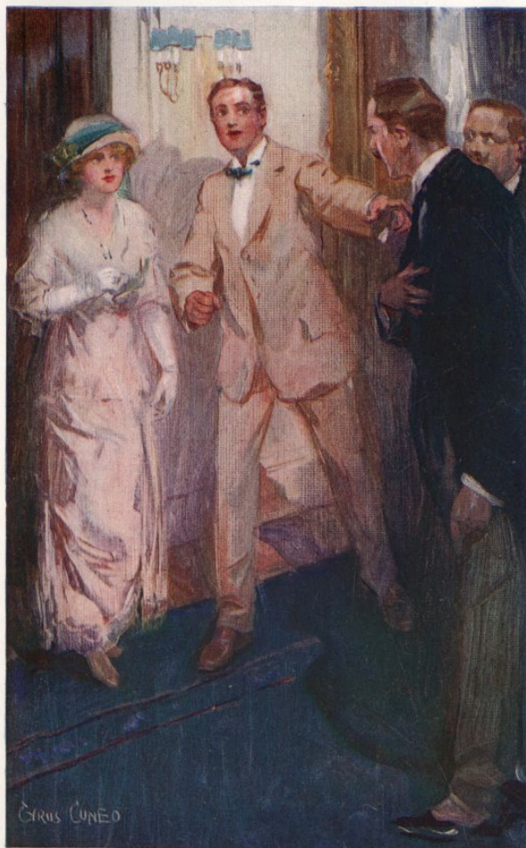
THE SPY UNMASKED