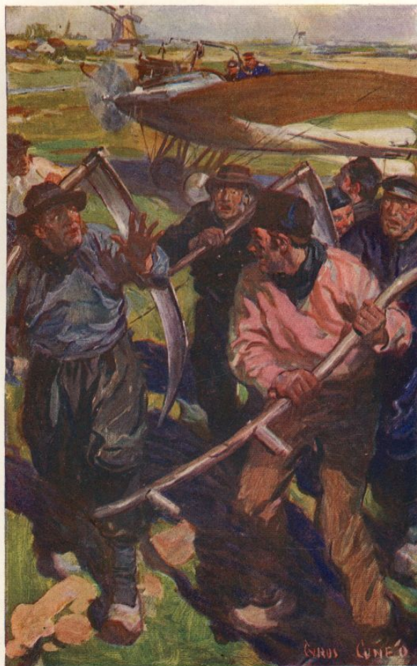
"THE PEASANTS SCATTERED OUT OF ITS PATH"