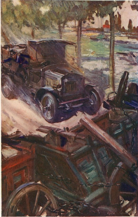
CLEARING THE ROAD