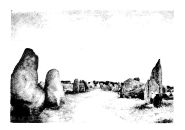
Stone Alignments at Kermaris, Carnac