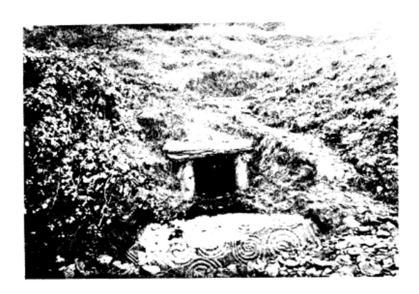
Entrance to Tumulus at New Grange