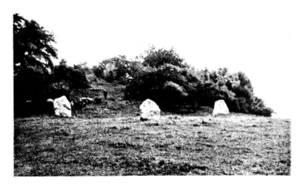
Prehistoric Tumulus at New Grange