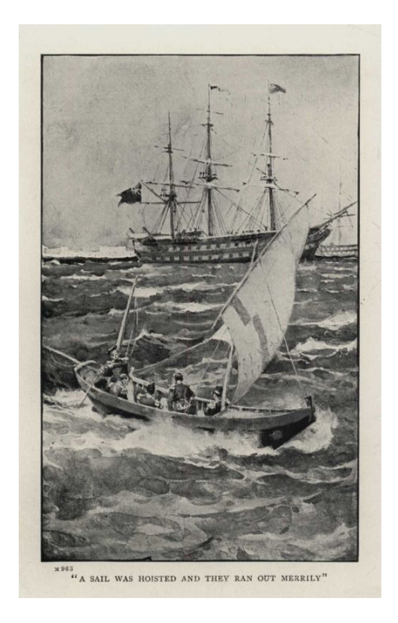
"A SAIL WAS HOISTED AND THEY RAN OUT MERRILY"