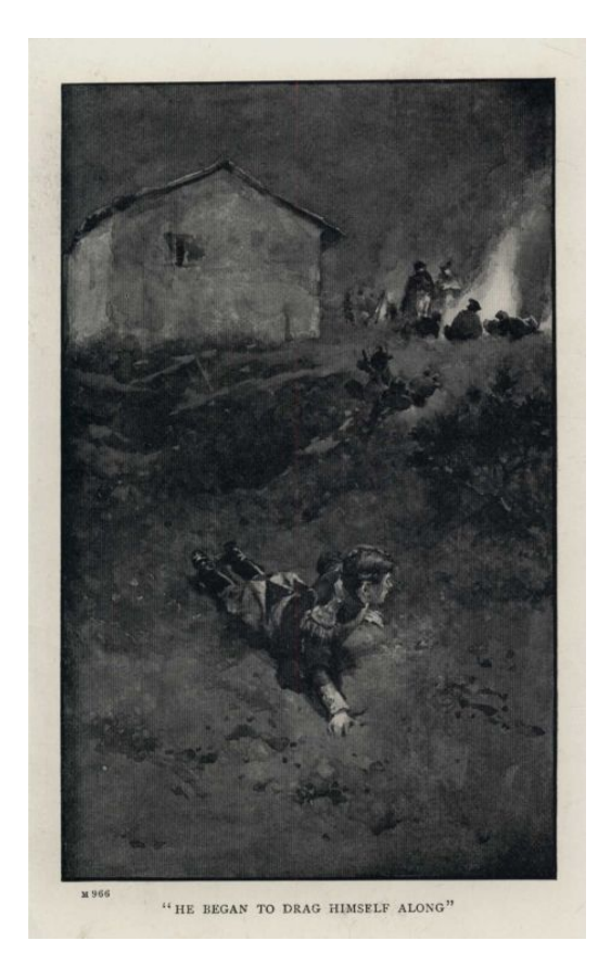
"HE BEGAN TO DRAG HIMSELF ALONG"