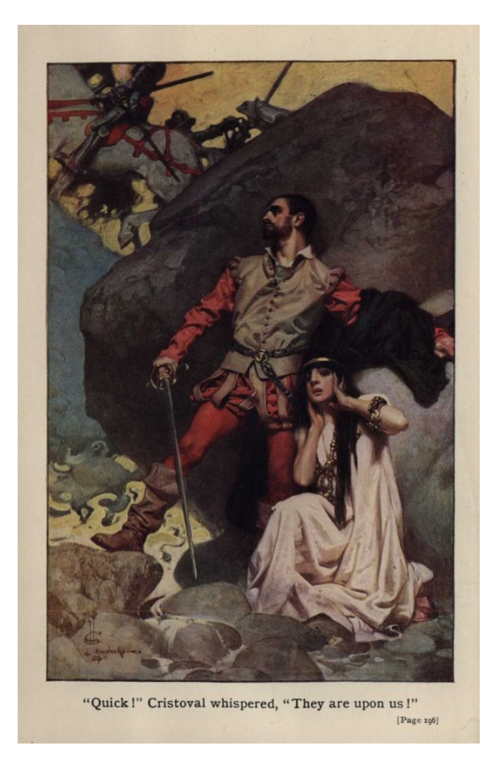
"Quick!" Cristoval whispered, "They are upon us!" (Page 196)