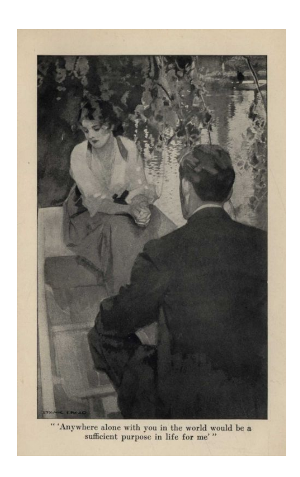
"Anywhere alone with you in the world would be a sufficient purpose in life for me"