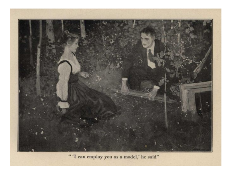
"I can employ you as a model,' he said"

"As a—a model . Monsieur?" she stammered.