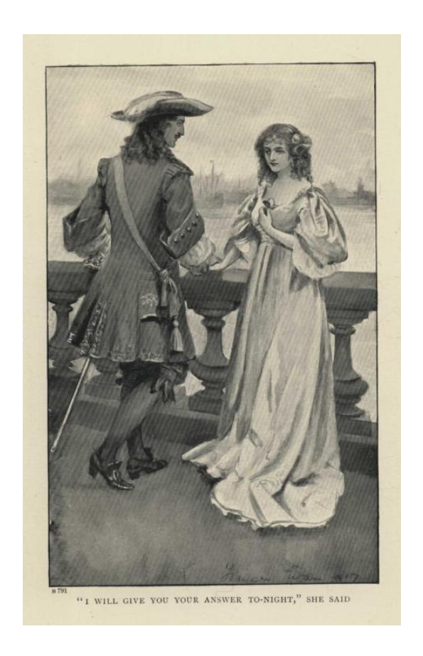
"I WILL GIVE YOU YOUR ANSWER TO-NIGHT," SHE SAID