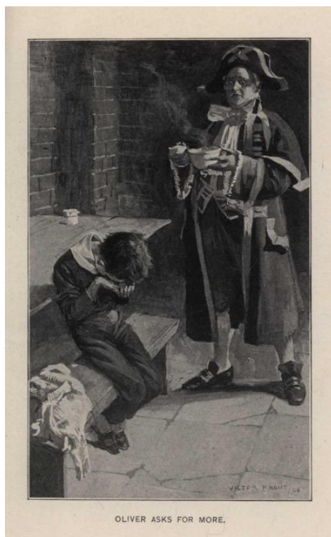
OLIVER ASKS FOR MORE.

and assisted by one or two women, ladled the gruel at meal times. Of this festive composition each boy had one porringer, and no more—except on occasions of great public rejoicing, when he had two ounces and a quarter of bread besides. The bowls never wanted washing. The boys polished them with their spoons till they shone again; and when they had performed this operation (which never took very long, the spoons being nearly as large as the bowls), they would sit staring at the kettle, with eager eyes, as if they could have devoured the very bricks of which it was composed; employing themselves, meanwhile, in sucking their fingers, with the view of catching up any stray splashes of gruel that might have been cast thereon.