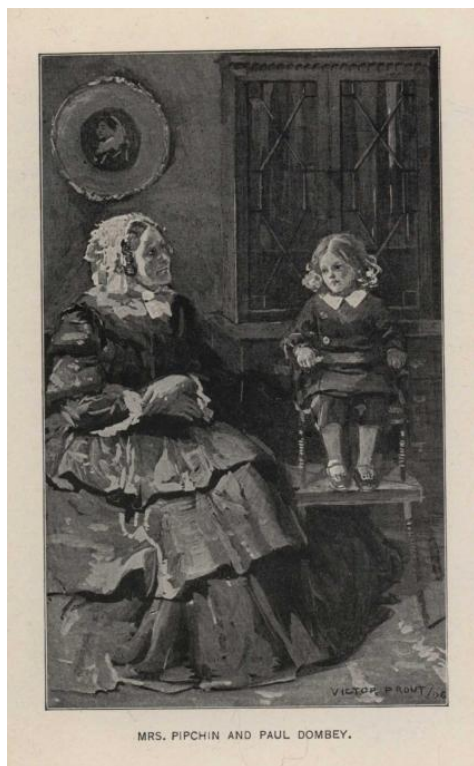
MRS. PIPCHIN AND PAUL DOMBEY.

His sister laughed and fondled him, and told him "No."