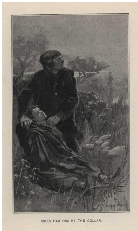
SIKES HAD HIM BY THE COLLAR.