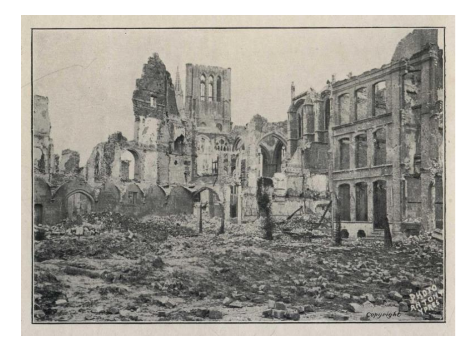
(Photograph-street in Ypres)

In a moment, with a little assistance, he had it working briskly in the opposite direction, and was hard at it, when a shell gave him a mortal wound.